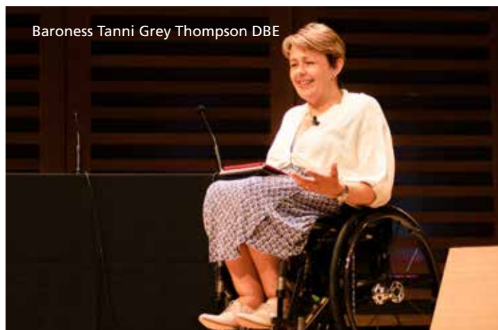
Baroness Tanni Grey Thompson DBE