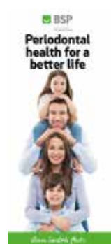
PATIENT INFORMATION LEAFLET