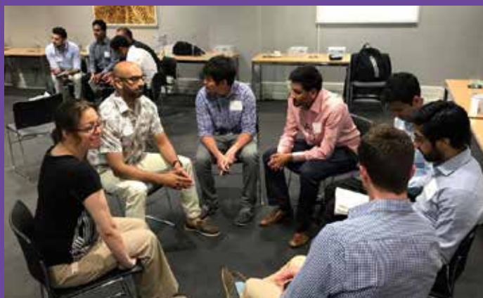
ABOVE: ECG LEADERSHIP COURSE