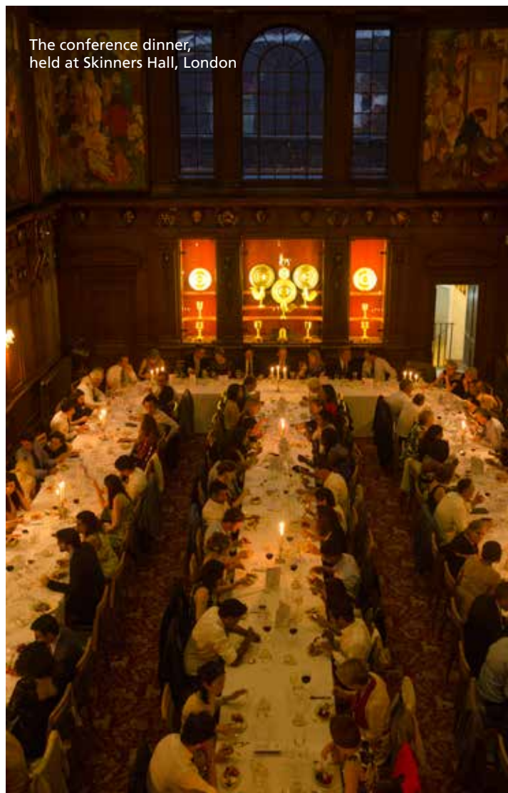
The conference dinner, held at Skinners Hall, London