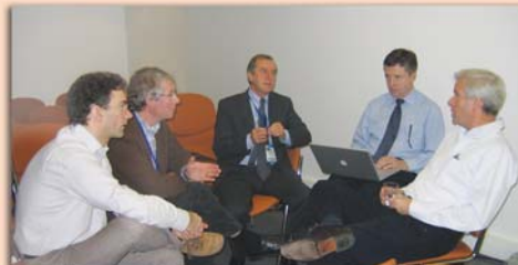
Strategic Planning Exercise of the EFP with Prospectus, Paris